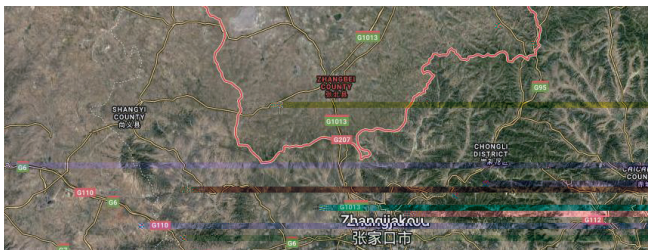
Figure 1.The location information of Zhangbei

Due to significant differences of external condition in the real world, photovoltaic modules as well as other parts of the installation are exposed to a broad range of irradiance and temperature changes. The rise of irradiation in the summer months is beneficial for the electric energy production but leads to the module temperature growth, which can decrease the efficiency of modules; however, it is beneficial for the N-TOPCon modules. The performance of panel is also influenced by the direction sunlight such as morning, dusk, cloudy, rain days, etc. During the low light part of the day, the drop of power of N-TOPCon is less influenced compared to P-PERC. According to the obtained data, the advantageous results are indicated that not only the energy density kWp/m2 but PV peak power kWh/kWp of N-TOPCon panels are higher than P-PERC in real external environment.